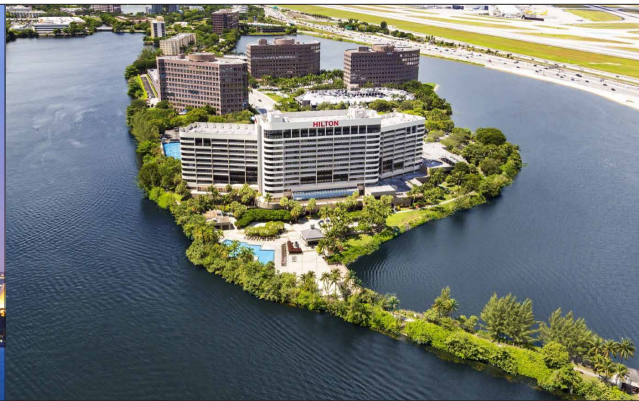
May 4 to 6, 2020 Miami, USA