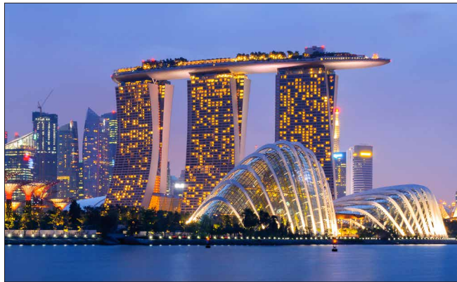
November 5 and 6, 2019 Singapore