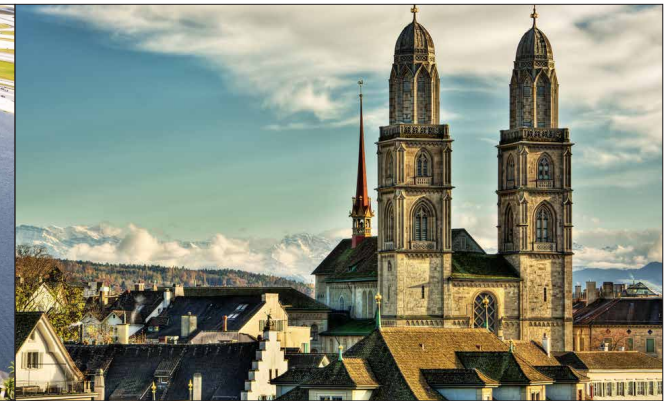
September 28 to 30, 2020 Zurich, Switzerland